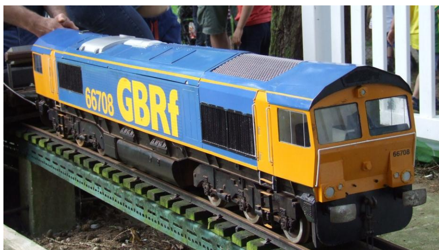
Right: the other Class 66 loco in the colourful GBRf livery